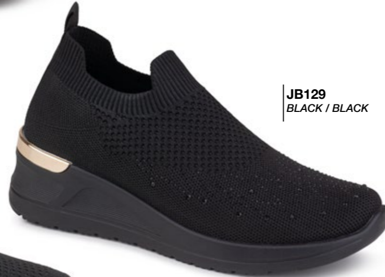
JB129 BLACK / BLACK